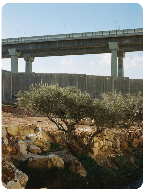
The Israeli Apartheid Wall that seperates Bethlehem from Jerusalem. 2023

considered separately or taken together, they amount to forced population transfer, a grave breach of international humanitarian law (IHL).