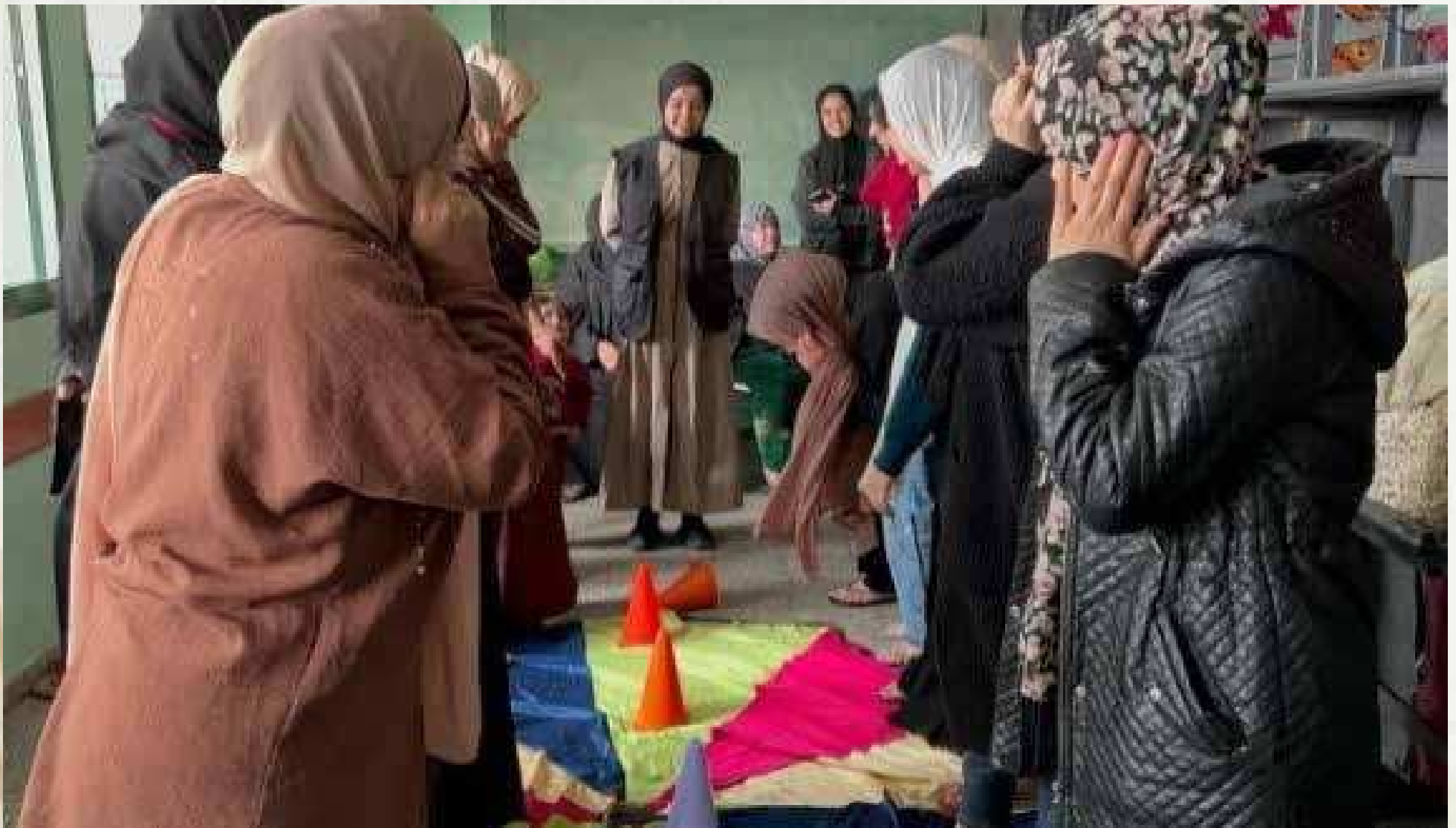
MECC-DSPR in Gaza has 103 staff to run the clinics, centers and outreach activities covering the whole Gaza strip. (MECC-DSPR)