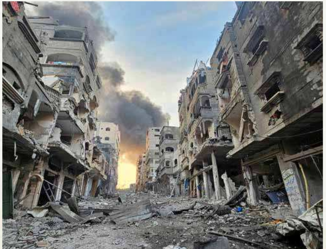
Destroyed neighborhood in Gaza.

Human rights organizations and the head of the United Nations—along with others—have declared a humanitarian disaster. Still, we don't understand how some Christians still support the ongoing indiscriminate attacks on Gaza and their country's supply to Israel of weapons, intelligence and cover from international law—in spite of the fact that Israel's colonial, racist apartheid project has turned now into an ongoing genocide.