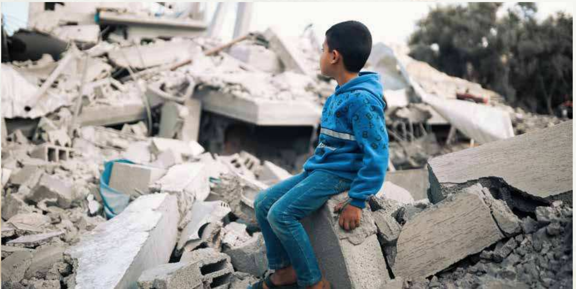
Displaced Palestinian child in Gaza sitting on the rubble of his house (SOS Children's Villages Palestine)

About 19,000 children lost the warmth of their families or were separated from their parents during the war in Gaza, which increases the number of those without family care in Palestine to more than 70,000 children. For them, growing up is often more about survival and basic needs than playing and learning. We work at SOS Children's Villages Palestine to provide alternative care for dozens of children, focusing on the trust and warmth of strong human connections. We succeeded in opening a shelter for unaccompanied children separated from their parents due to the war in Gaza. In light of the continuing war and the economic situation that families are experiencing in Gaza and the West Bank, SOS Children's Villages has been able, over the past few months, to provide cash assistance to more than 6,700 individuals, children, and families, and has implemented more than 2,700 extracurricular and recreational